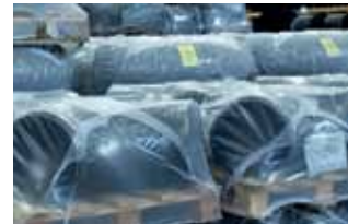
Packaging and shipping