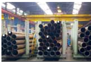
Tubes (European/ Premium)